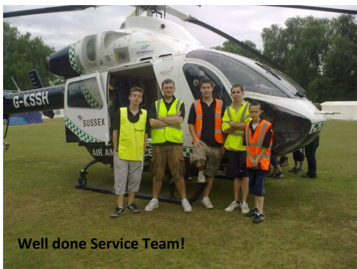
Well done Service Team!

The Air Ambulance was called by paramedics when an adventurous camper sustained an injury. After a period of observation the casualty went to hospital in the regular ambulance and returned to his group later that evening to continue his activities. However, while waiting for a decision, the air ambulance crew showed off their helicopter and allowed campers a close up look at the aircraft before being called away to another incident. We have a letter complimenting the Service Teams here that day, and we add our own thanks to them for their calm professional approach to the situation which fortunately turned out not to be serious.